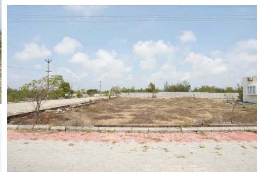
Actual site images